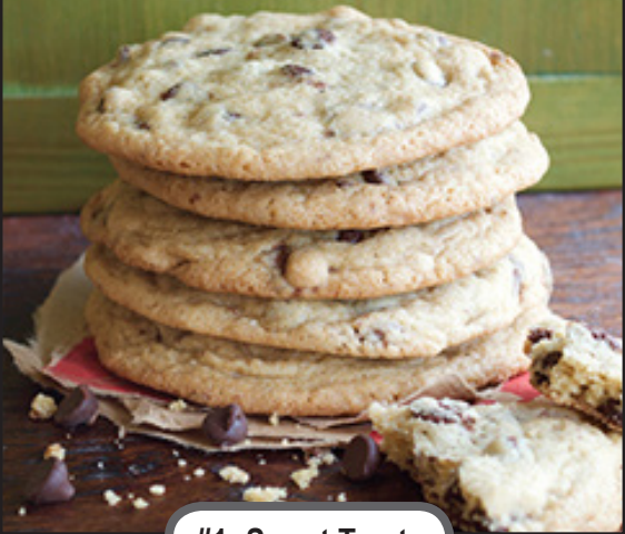
#1- Sweet Treats