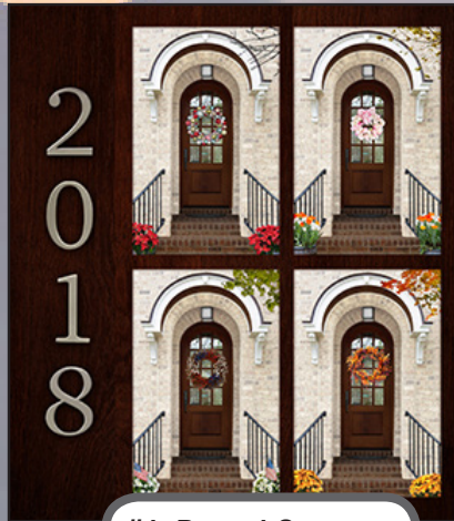
#4- Door 4 Seasons